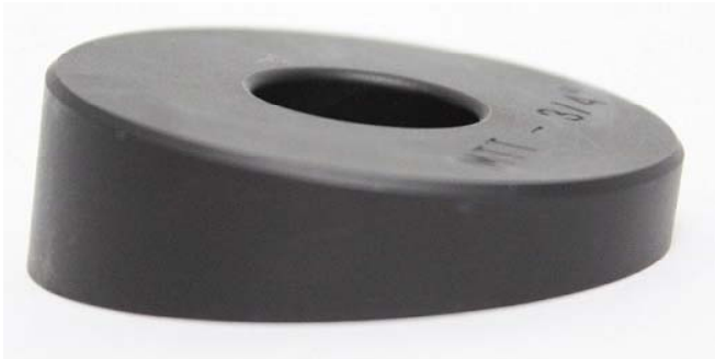
Plain Wedge Washer