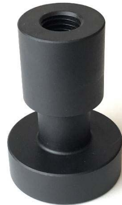
Short Bolt Adapter