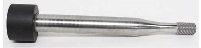
Tensile Nut Proof Load Test Fixture