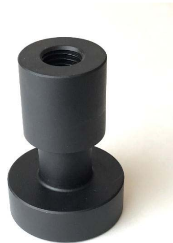
Short Bolt Adapter